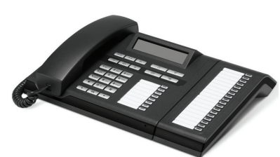
OpenStage 30 with OpenStage Key Module 15